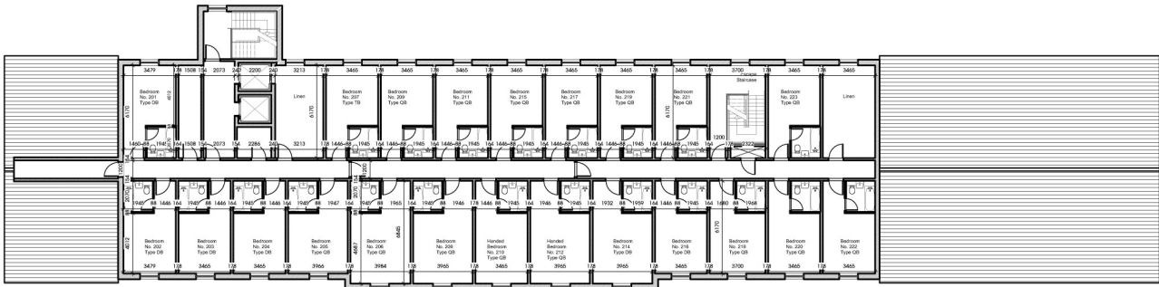
PROPOSED SECOND FLOOR PLAN

NO PART OF THIS DOCUMENT IS TO BE REPRODUCED OR TRANSMITTED IN ANY FORM OR BY ANY MEANS, ELECTRONIC OR MECHANICAL, INCLUDING PHOTOCOPYING, RECORDING, OR BY ANY INFORMATION STORAGE AND RETRIEVAL SYSTEM, WITHOUT THE WRITTEN PERMISSION OF HTA ARCHITECTS. ISSUED FOR: ALL DIMENSIONS SHOWN ON THIS DRAWING SHALL BE TAKEN FROM THIS DRAWING UNLESS OTHERWISE SPECIFIED.